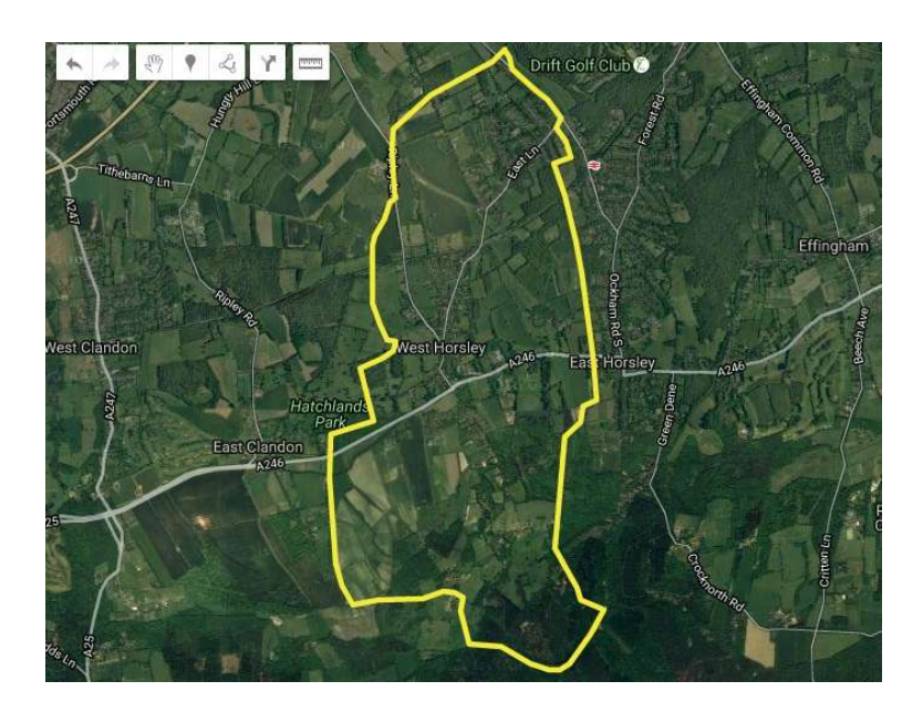
String 1 - Community Assets

1. There are three strings to this sub-group's considerations, which are intended to form part of the evidence base in support of the draft policy proposals for the West Horsley Neighbourhood Plan to be prepared by O'Neill Homer. The West Horsley Neighbourhood Area follows the boundary of West Horsley Parish, which is depicted on the following map: